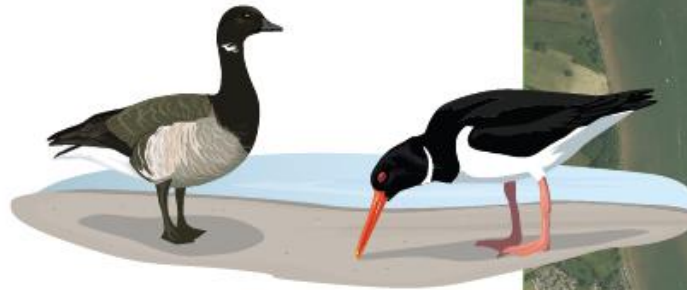
Dark-bellied Brent Goose & Oystercatcher

The Imperial Recreation Ground slipway is still available for users during these winter months and users can access the foreshore this way. Dog walkers are asked to turn left at the end of the slipway, to avoid the refuge.